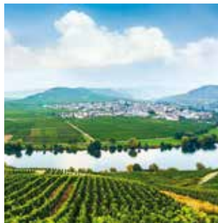
Moselle river valley / Germany

Return to Frankfurt. Along the way, we travel through the city of Worms, also known as the city of Nibelungen. The Worms cathedral is one of the most stunning Romanesque churches in Germany, rivaling the beauty of the cathedrals of Speyer and Mainz. After a city tour, the program ends in Frankfurt.