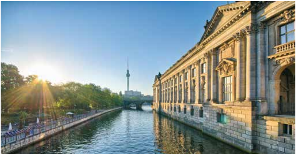
Museum Island, Berlin / Germany

Optional private transfer to the airport.