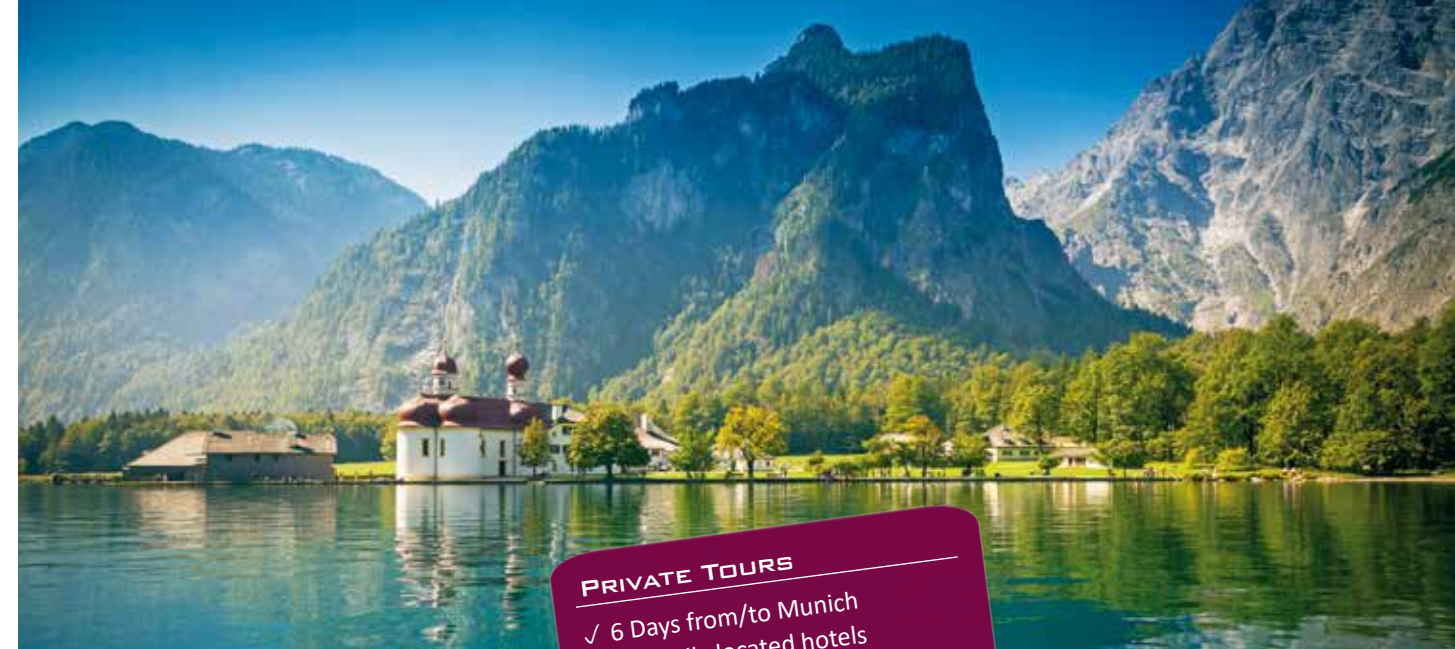
Königssee Lake, Berchtesgaden / Germany

PRIVATE TOURS ✓ 6 Days from/to Munich ✓ Centrally located hotels ✓ Visit Bavaria's most beautiful cities