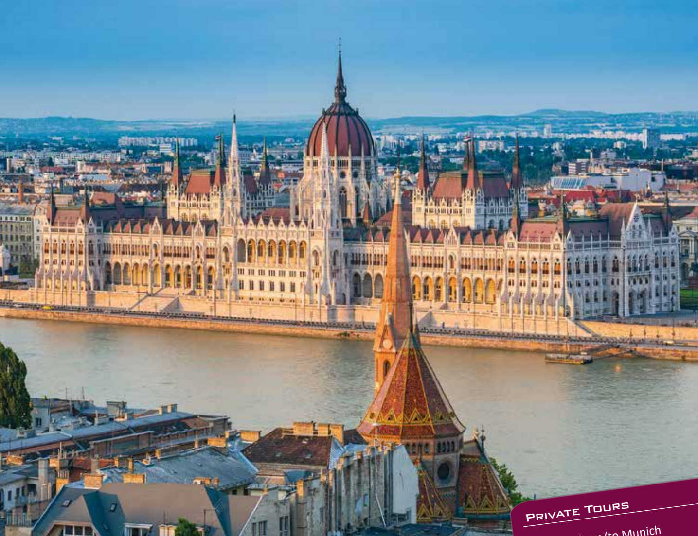
Budapest / Hungary