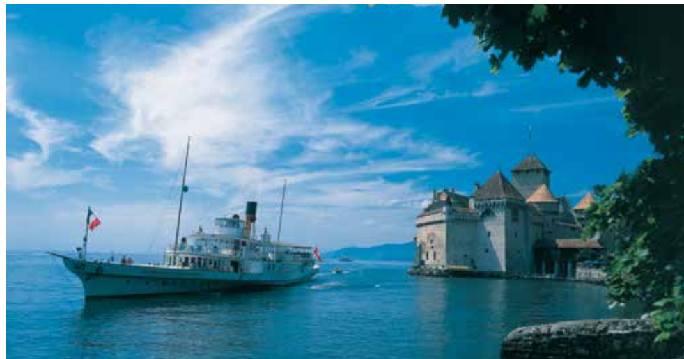
Chillon Castle, Montreux / Switzerland

Transfer to the train station at own expense. Travel by train to Geneva. The tour ends at the Geneva train station.