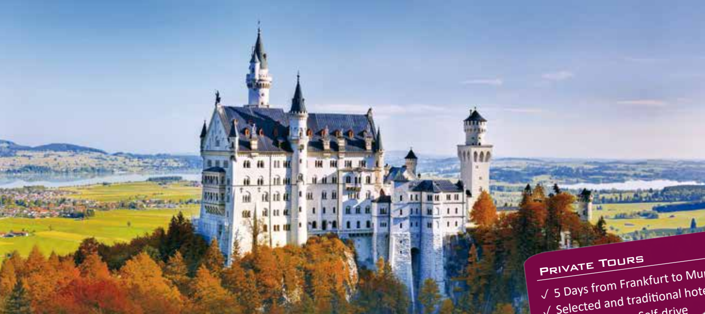
Neuschwanstein Castle / Germany

PRIVATE TOURS ✓ 5 Days from Frankfurt to Munich ✓ Selected and traditional hotels ✓ Private Tour or Self-drive