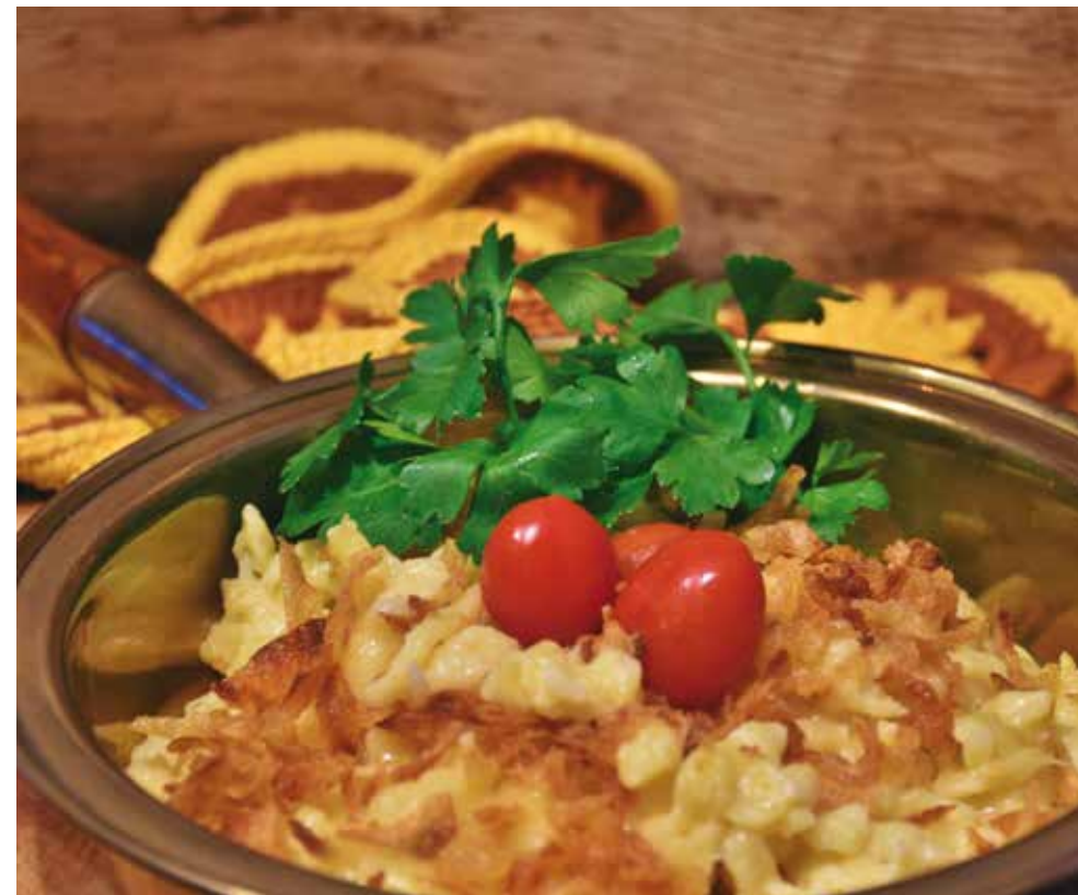
"Kässpätzle" / Germany