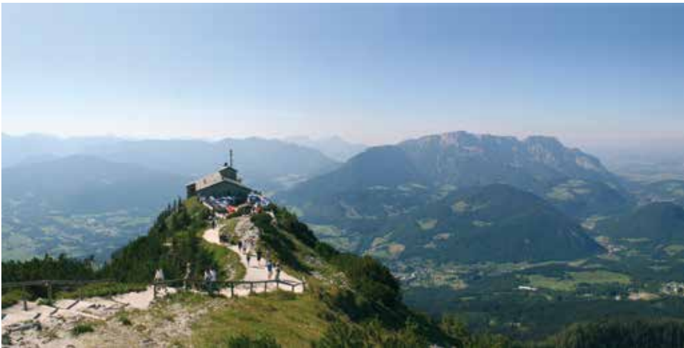
Kehlsteinhaus Region Berchtesgaden / Germany

Day 7 Warsaw In the morning city tour of historic Warsaw. Discover the history of the Siege of Warsaw between the Polish Warsaw Army and the German Army. Visit places and monuments such as the Jewish Ghetto, Ghetto Wall fragments and the Krasiński Square. End of the tour in the afternoon.