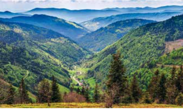
Black Forest / Germany

Day 4 Freiburg - Basel On the way to the airport, if there is time, we recommend to visit Lake Titisee or the Triberg waterfalls, which are located in the heart of the Black Forest. Drive to the airport and return the rental car.