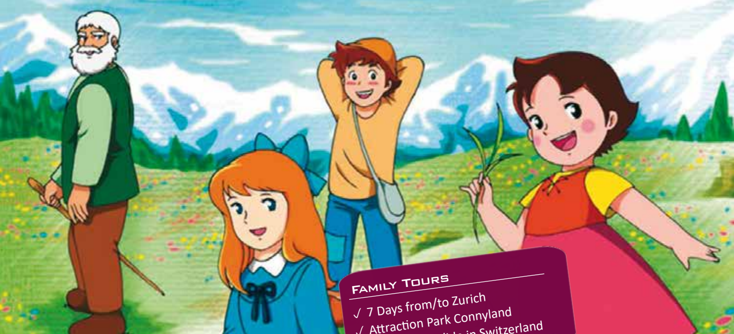
Kassel / Alemania

FAMILY TOURS ✓ 7 Days from/to Zurich ✓ Attraction Park Connyland ✓ The longest slide in Switzerland