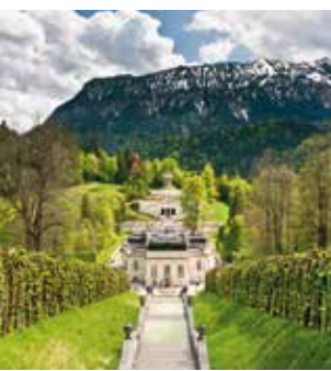
Linderhof Castle / Germany

Day 4 Augsburg - Füssen - Neuschwanstein Travel to Füssen, the most southern point of the Romantic Road. Visit the fairytale Neuschwanstein Castle. Built by "Mad King", Luis II, the castle served as the inspiration to Walt Disney's castle of Sleeping Beauty. Travel back in time and arrive at the castle in a horse-drawn carriage. Then visit the