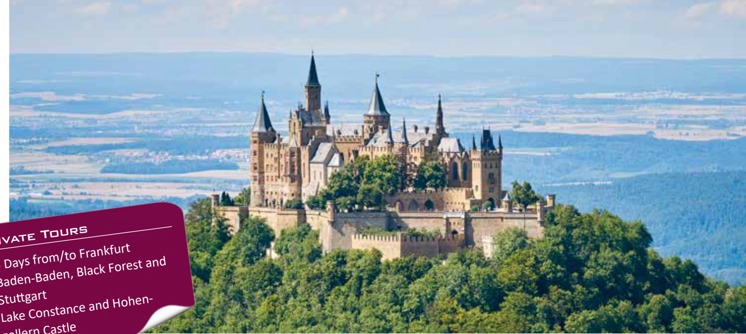
Hohenzollern Castle / South Germany