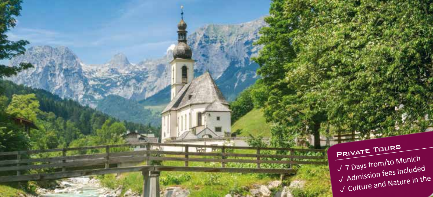
Berchtesgaden / Germany