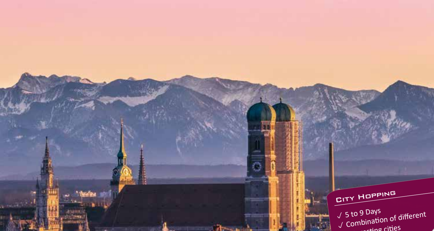
Munich / Germany