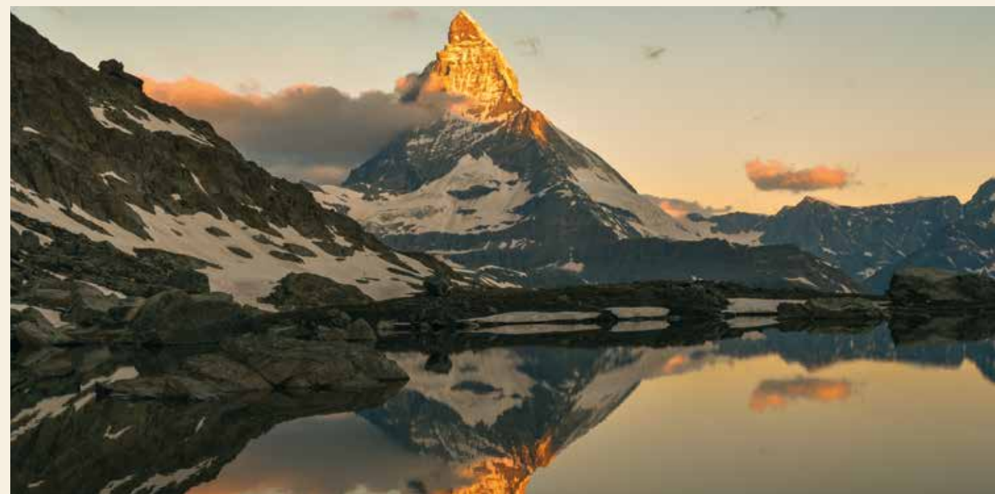
Mount Matterhorn / Switzerland