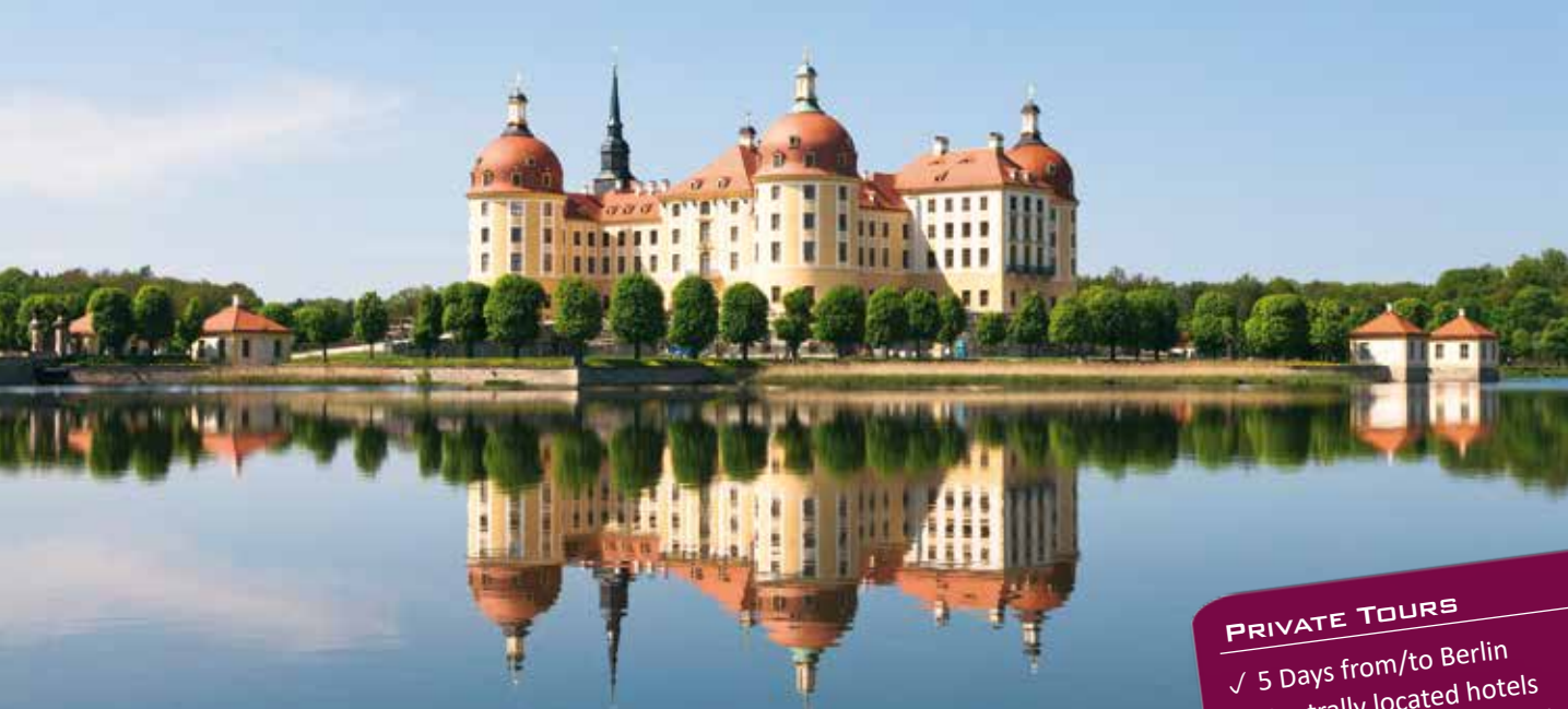
Moritzburg Castle / Germany