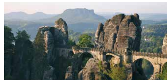
“Saxon Switzerland” / Germany

Travel to Berlin. On the way to Berlin we visit Leipzig and enjoy a sightseeing tour. For several centuries Leipzig was the economic and spiritual center of Europe. Continue to Berlin.