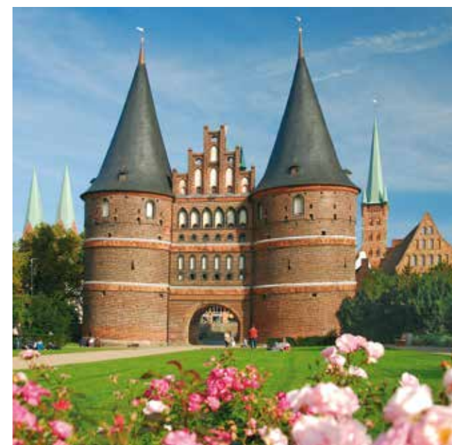
Lübeck / Germany