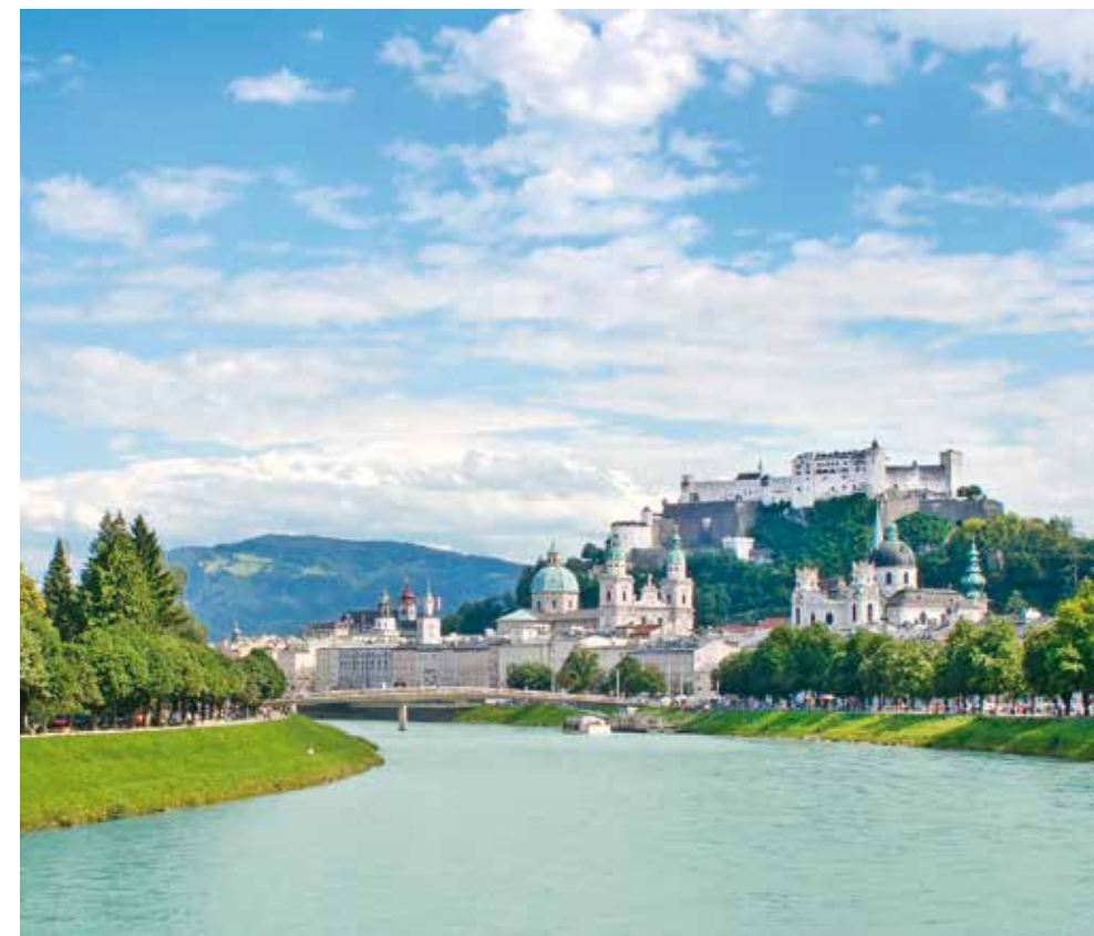
Salzburg / Austria