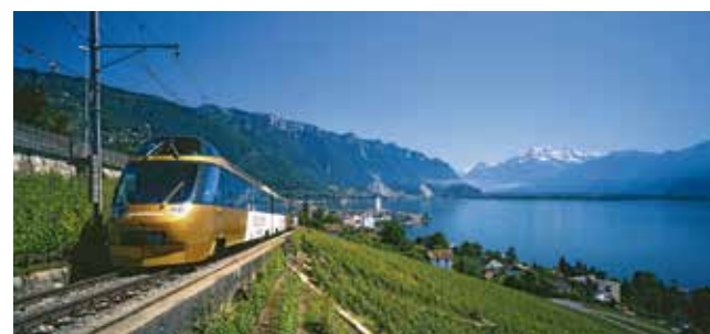
Golden Pass Line / Switzerland

Standing approximately 2.100 meters above sea level, Mount Pilatus is one of the highest peaks in the Lucerne region. Travel to the top aboard the steepest cog railway in the world (up to 48% grade), a 30 minute ride. The views of Lake Lucerne and the Alps are truly spectacular. Return to Lucerne. The afternoon is free to explore on your own.