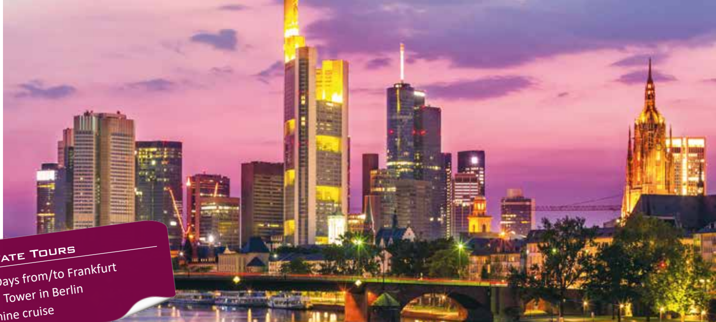
Frankfurt / Germany