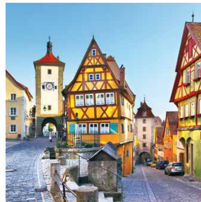
Rothenburg / Germany

After breakfast take the hotel shuttle service to the airport.