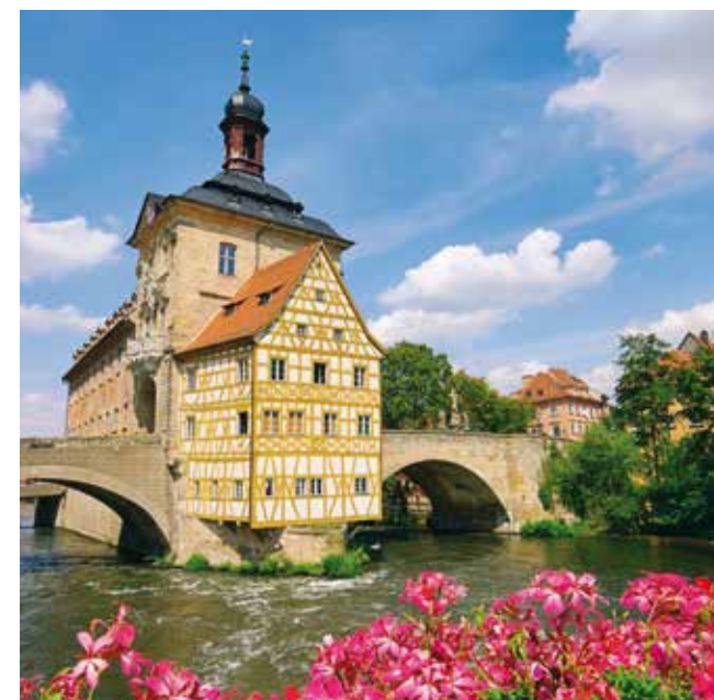
Bamberg / Germany

After a visit to the Heidelberg Castle and the historic center, we conclude the tour at Frankfurt airport.