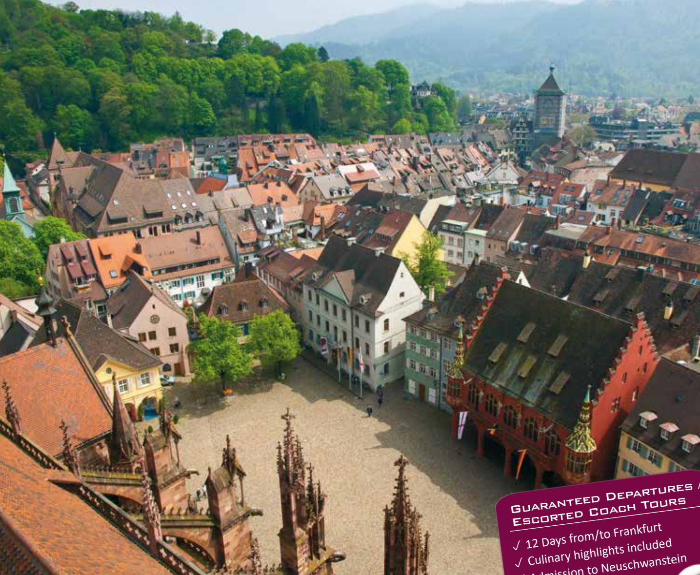
Freiburg / Germany

GUARANTEED DEPARTURES / ESCORTED COACH TOURS ✓ 12 Days from/to Frankfurt ✓ Culinary highlights included ✓ Admission to Neuschwanstein Castle