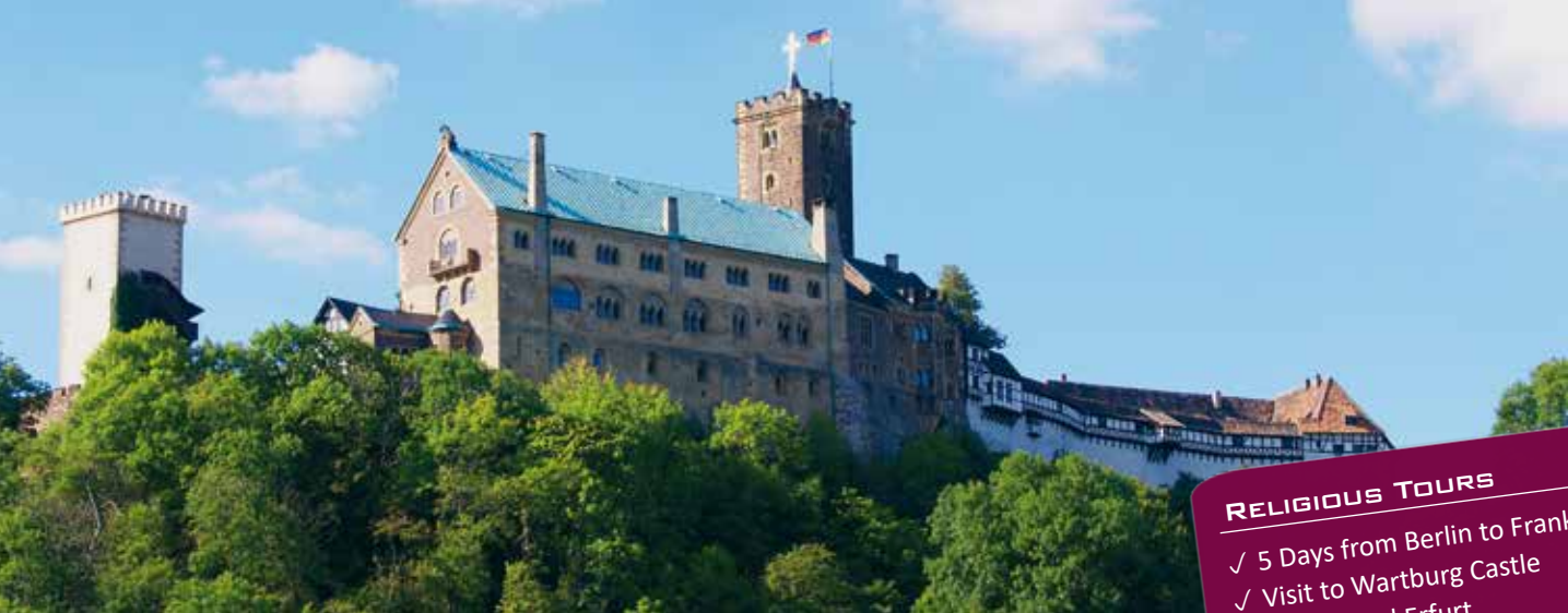
Wartburg Castle / Germany