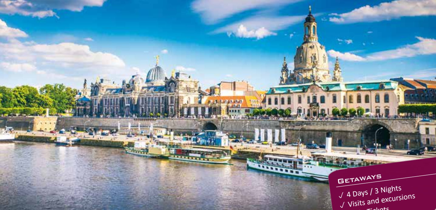
Historic center, Dresden / Germany