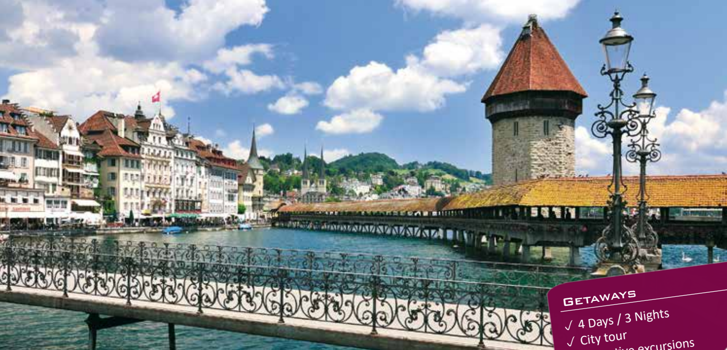
Bridge Kapellbrücke, Lucerne / Switzerland