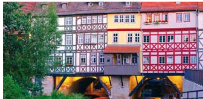
Kraemerbrücke, Erfurt / Germany

In the morning you are free to explore Erfurt at your leisure. As an alternative you may also visit the Wartburg (not included). Return to Frankfurt. The program ends at Frankfurt Airport, around 6 pm.