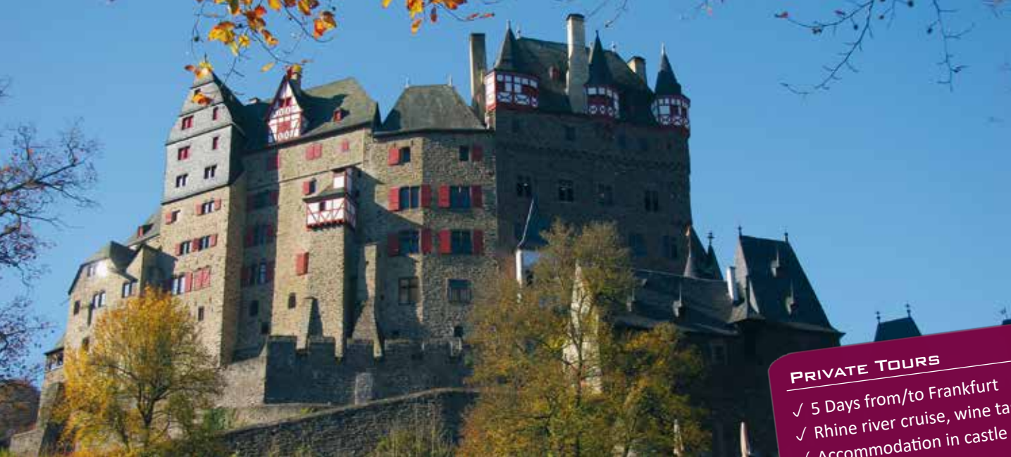
„Burg Eltz“ Castle, Moselle river valley / Germany