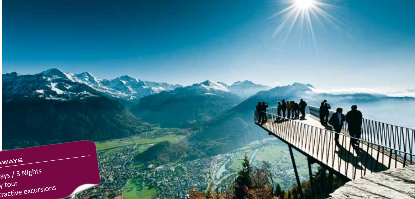
Harder Kulm, Interlaken / Switzerland