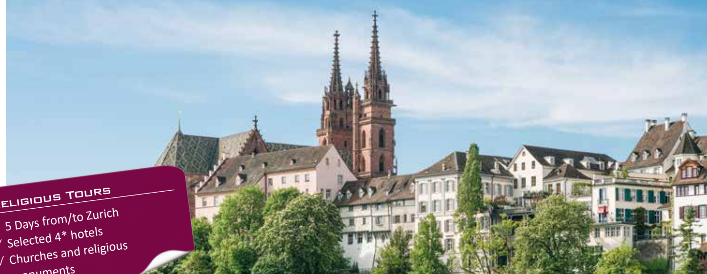
Basel / Switzerland