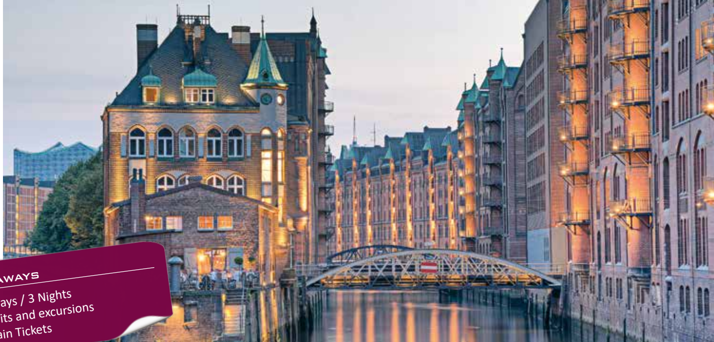
Warehouse city “Speicherstadt”, Hamburg / Germany

Travel period: Jan 01, 2018 - Mar 31, 2019 Departure dates: daily