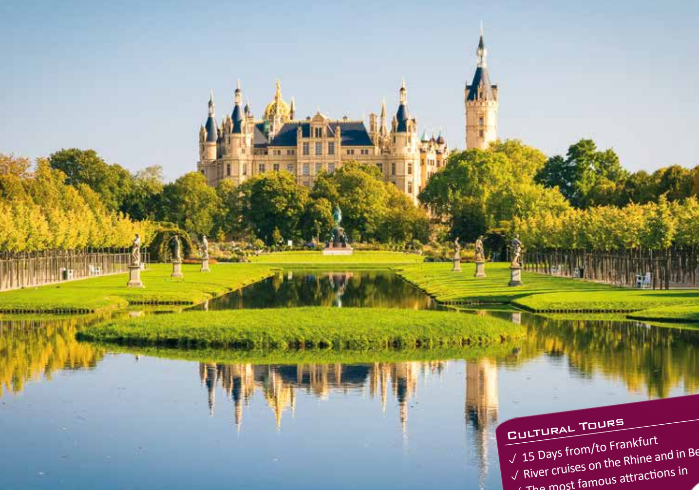
Schwerin Castle / Germany