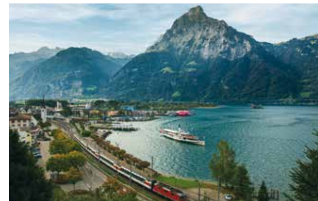
Gotthard Panorama Express / Switzerland