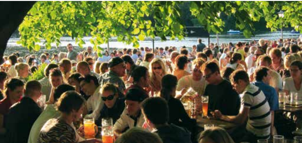
Beer garden, Munich / Germany

Optional private transfer to the airport.