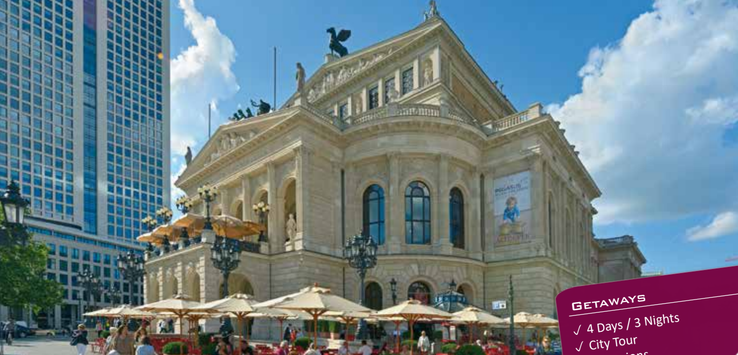
Opera Frankfurt / Germany