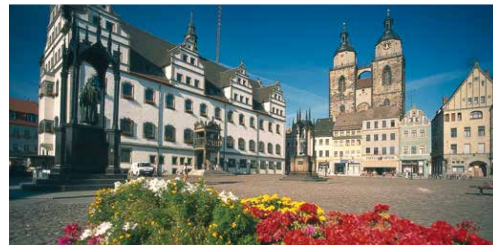
Wittenberg / Germany