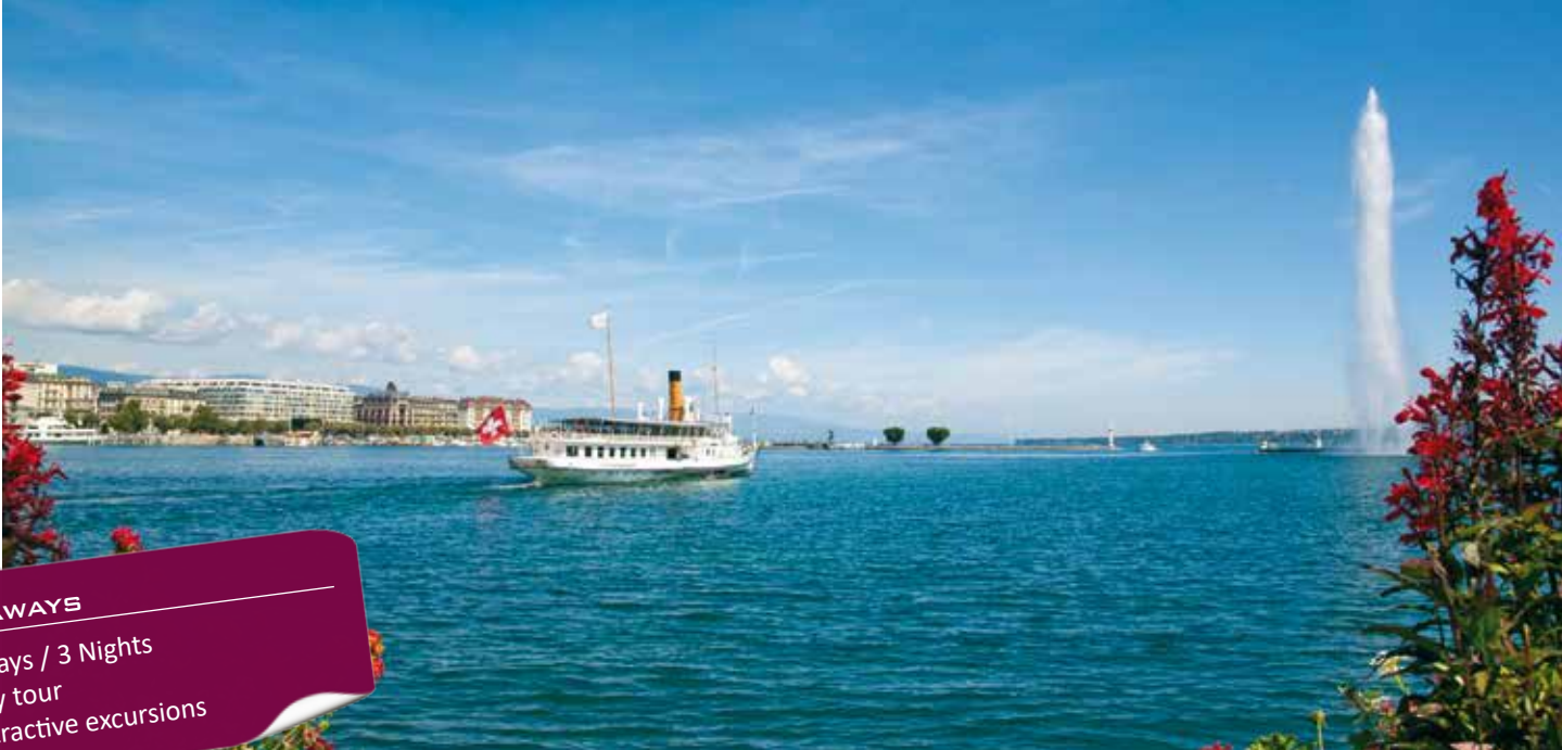
Jet d'eau foundation, Geneva / Switzerland