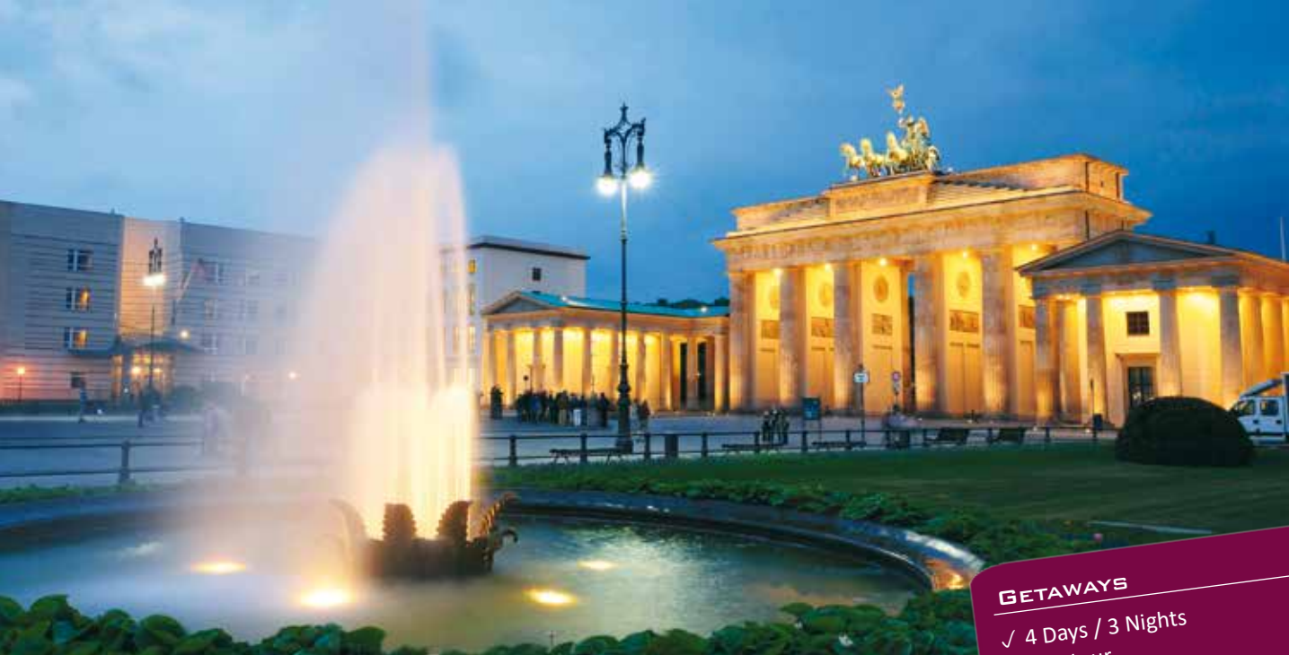
Brandenburg Gate, Berlin / Germany