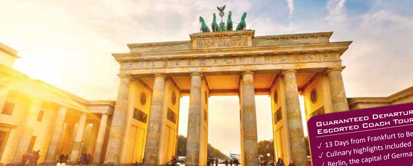
Berlin / Germany

GUARANTEED DEPARTURES / ESCORTED COACH TOURS