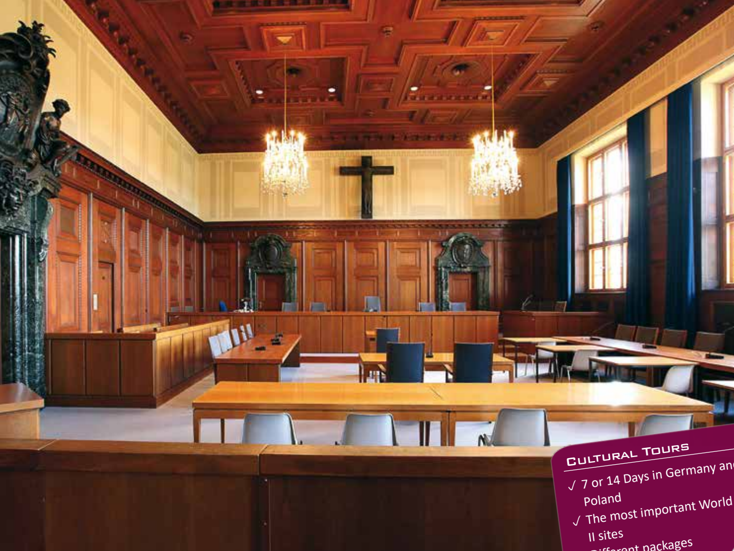
Courtroom 600, Nuremberg / Germany