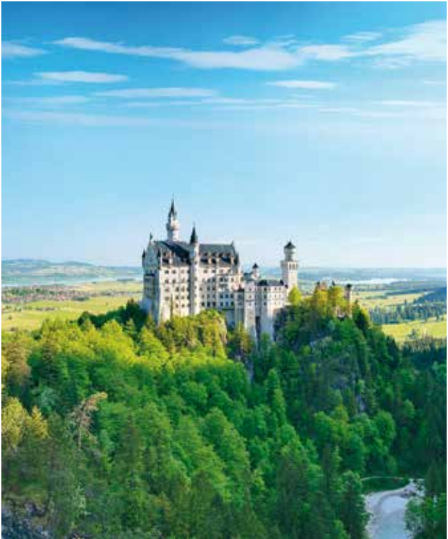
Neuschwanstein Castle / Germany

Day 12 / Thursday Frankfurt After breakfast transfer to the airport. End of tour.