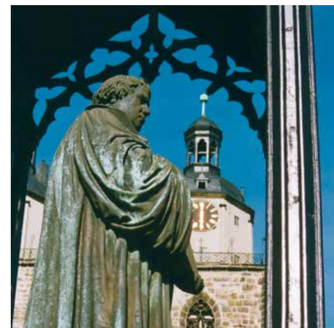
Martin Luther statue / Germany

Today we enjoy a brief walking tour in Worms to see the site of the Worms Debates (Diet of Worms), the Reformation Monument, St. Peters, and the Church of the Holy Trinity. We continue to Mainz, where we visit the city and the Gutenberg Museum. You also see its most prized exhibit, the world-famous Gutenberg Bible, the first major book printed in the West using movable type. Also in the heart of Mainz you see St. Martin's Cathedral considered the high point of Romanesque cathedral architecture in Germany. The trip ends in Frankfurt.