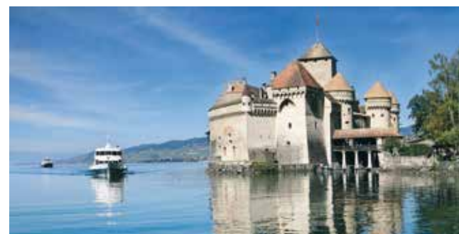
Montreux / Switzerland

On the way to Zurich we make a short stop in Montreux, located at the foot of the Alps at the eastern end of Lake Geneva. Montreux boasts one of the most beautiful walks along the lake, stretching from Villeneuve all the way towards Vevey.