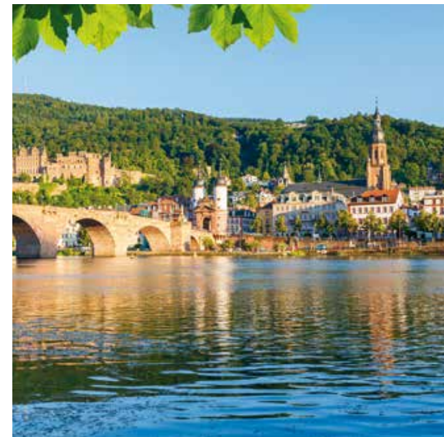
Heidelberg / Germany

and head for Rothenburg, one of the oldest and most beautiful cities along the Romantic Road. Sightseeing tour of this lovely medieval town concluding with your last typical German lunch. Franconia is famous for its delicious potato dumplings. The tour ends in Frankfurt.