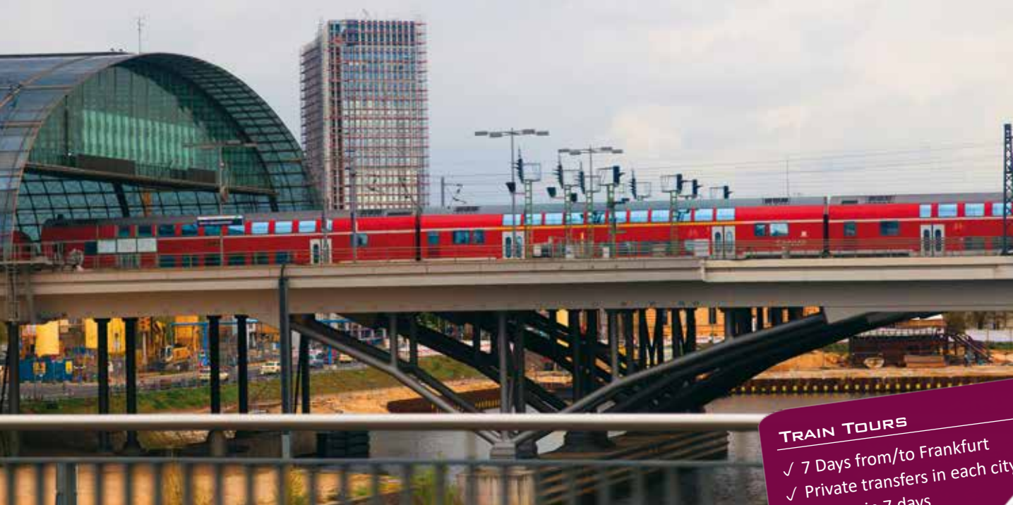
Main station, Berlin / Germany