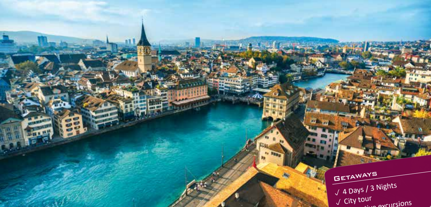
Historic center, Zurich / Switzerland