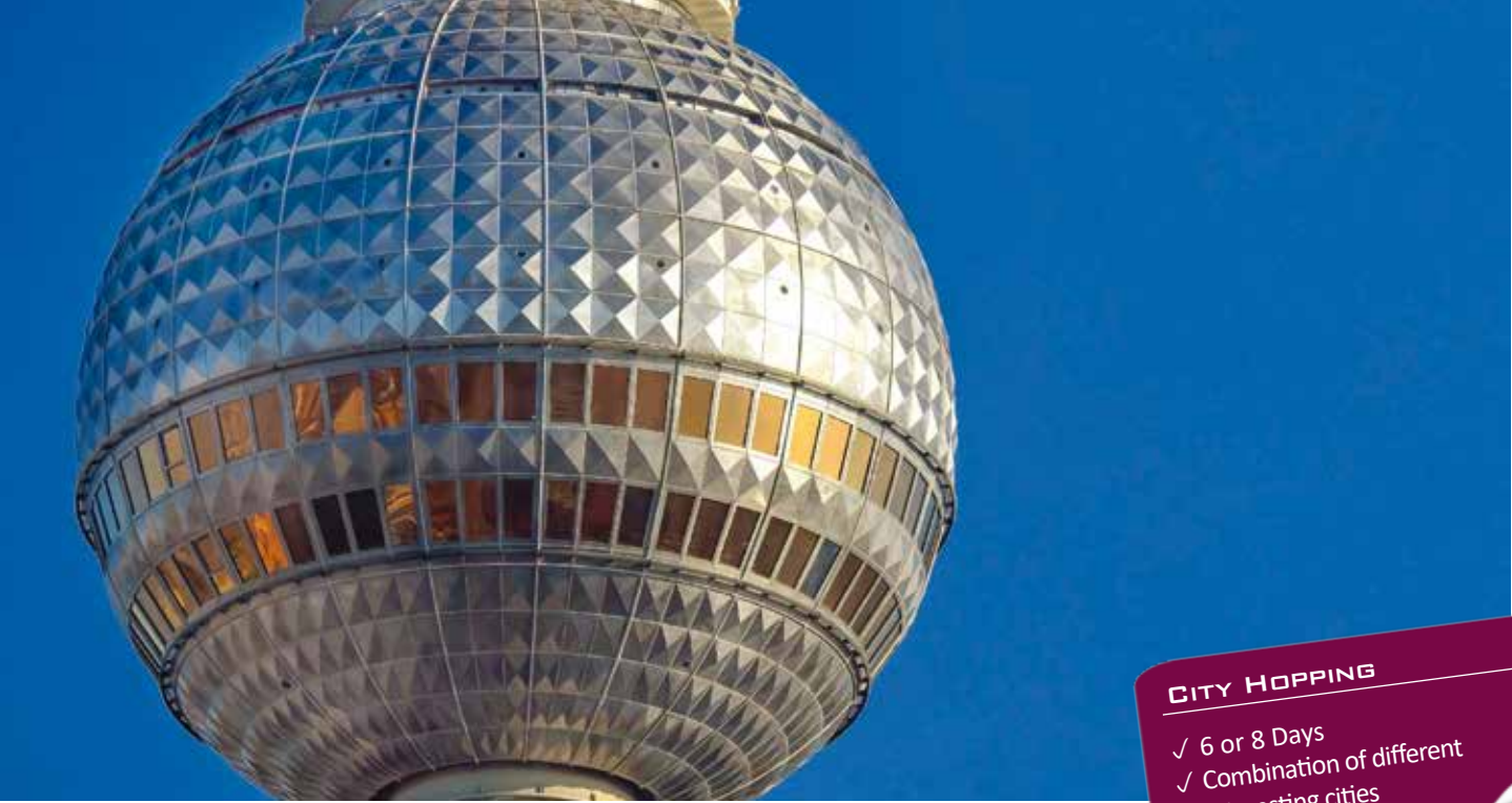
TV tower, Berlin / Germany