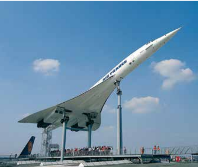
Auto-Technology Museum, Sinsheim / Germany

The first zeppelins were built here and later at the Company Dornier continuing building aircrafts . Visit the Zeppelin Museum that houses a cabin of the aircrafts that used to fly around the world in the 30s of the last century. We also highly recommend to take a boat trip on the largest Lake in Germany.