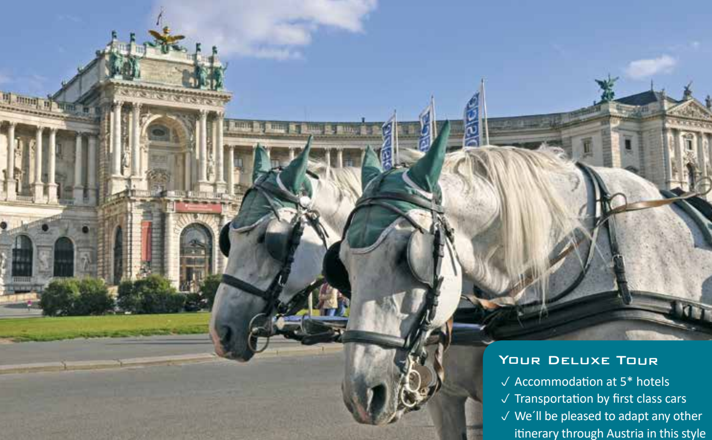
Hofburg Palace, Vienna / Austria