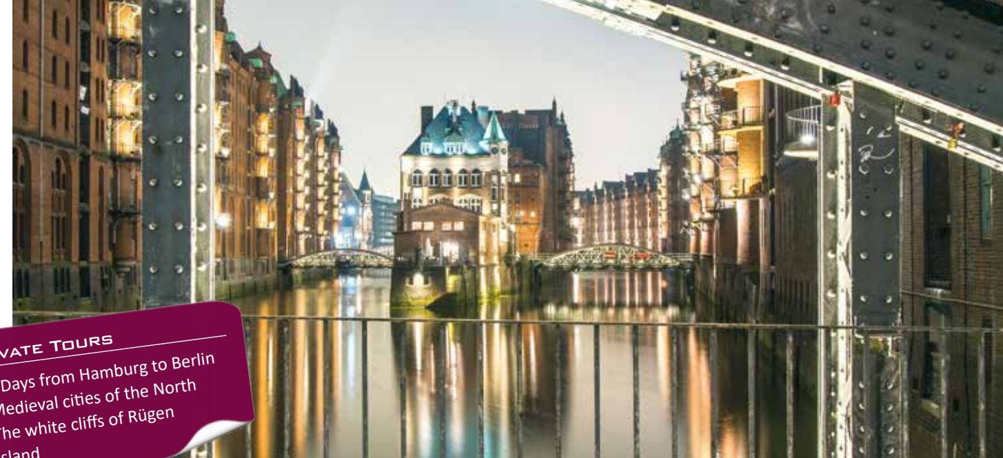
Hamburg / Germany