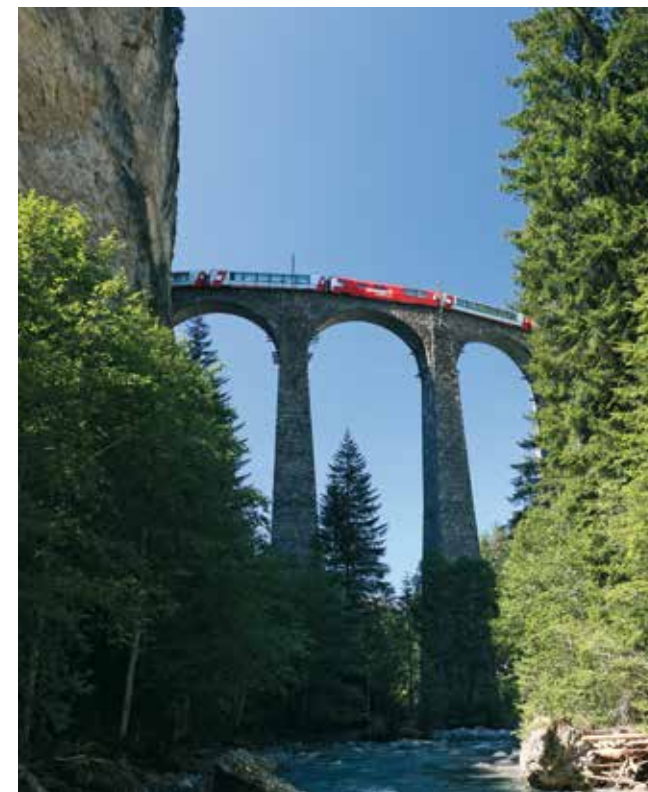
Glacier Express / Switzerland

Make your way to the train station in Lucerne at your convenience to board the train to Zurich. The tour ends at the Train Station or Airport in Zurich.