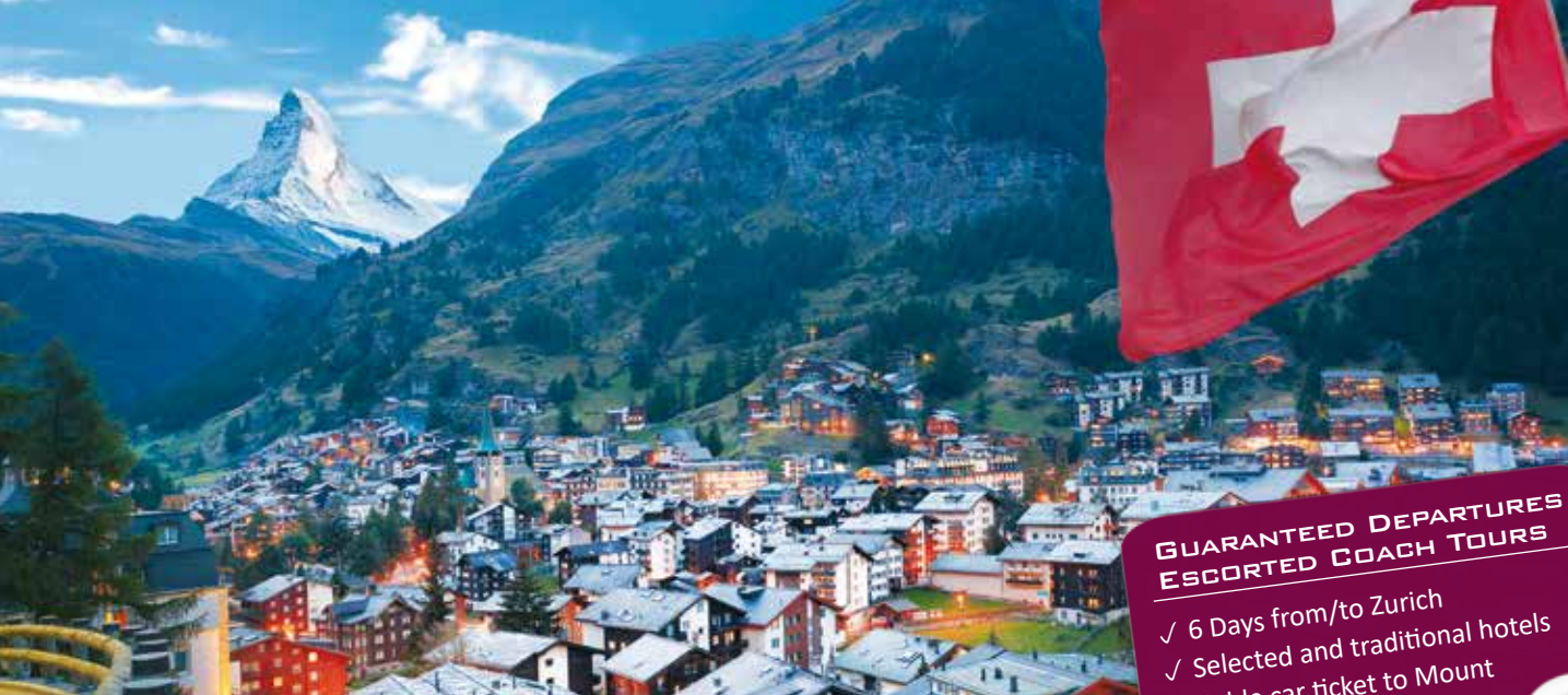
Zermatt / Switzerland

GUARANTEED DEPARTURES / ESCORTED COACH TOURS