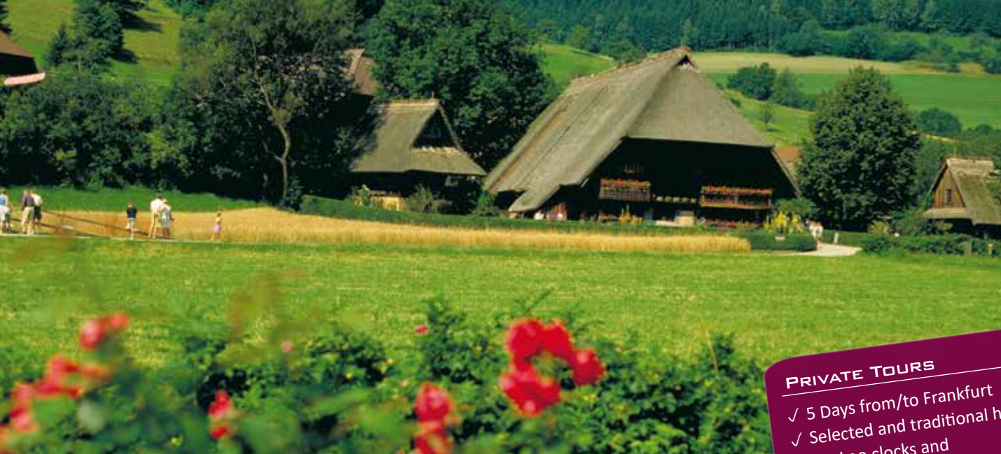
Black Forest / Germany

PRIVATE TOURS ✓ 5 Days from/to Frankfurt ✓ Selected and traditional hotels ✓ Cuckoo clocks and Baden-Baden