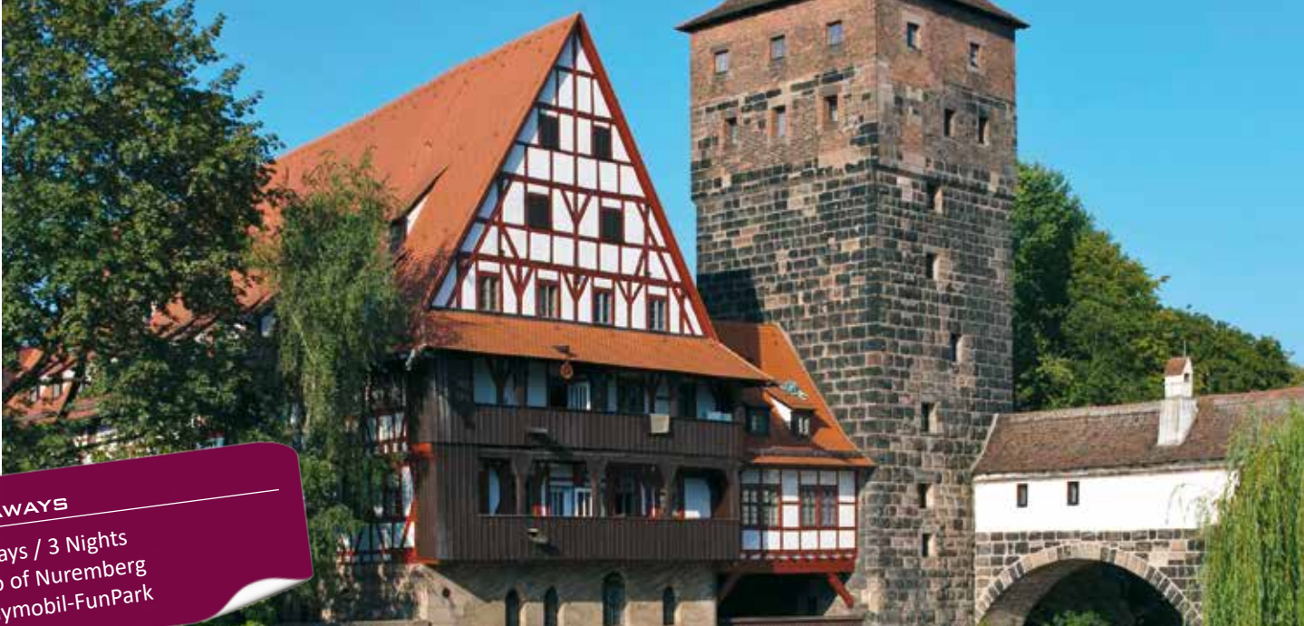
Old town, Nuremberg / Germany

* The Pillnitz Castle is open from May to October, Tuesday-Sunday, ticket not included.